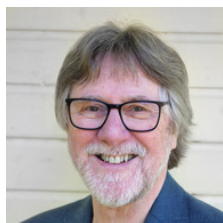
Steve Gill - Photographic Restoration and Conservation